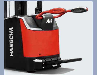
The integrated stamping molded guardrail offers better protection for the operator