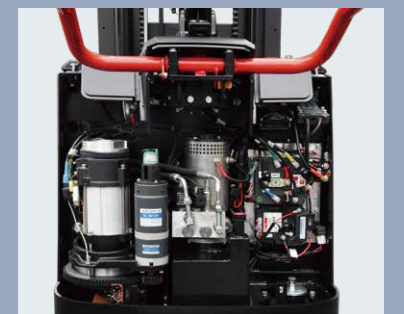
Back cover can be opened fully, and all components and parts are clear at a glance, which is very convenient for maintenance of the entire machine