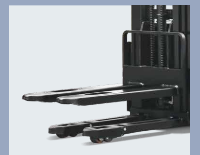
Tandem load wheel